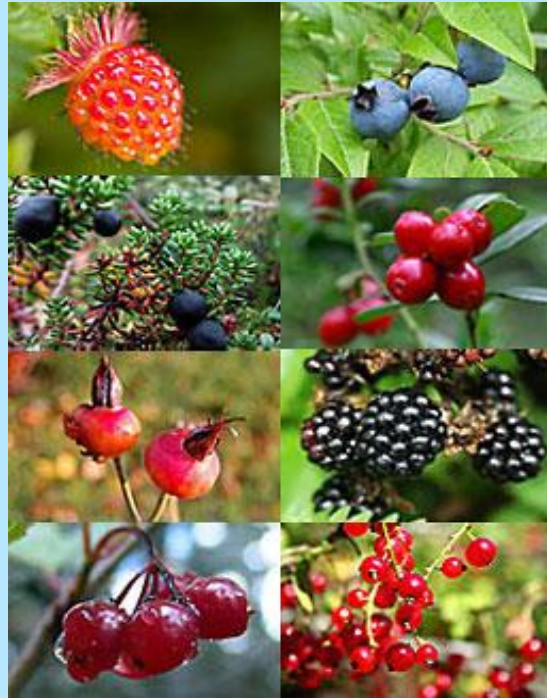
Wild Berry Products