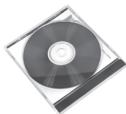
9 _____ CD