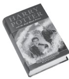
7 _____ book