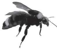
1 _____ insect