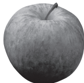
5 _____ apple