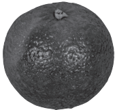
6 _____ orange